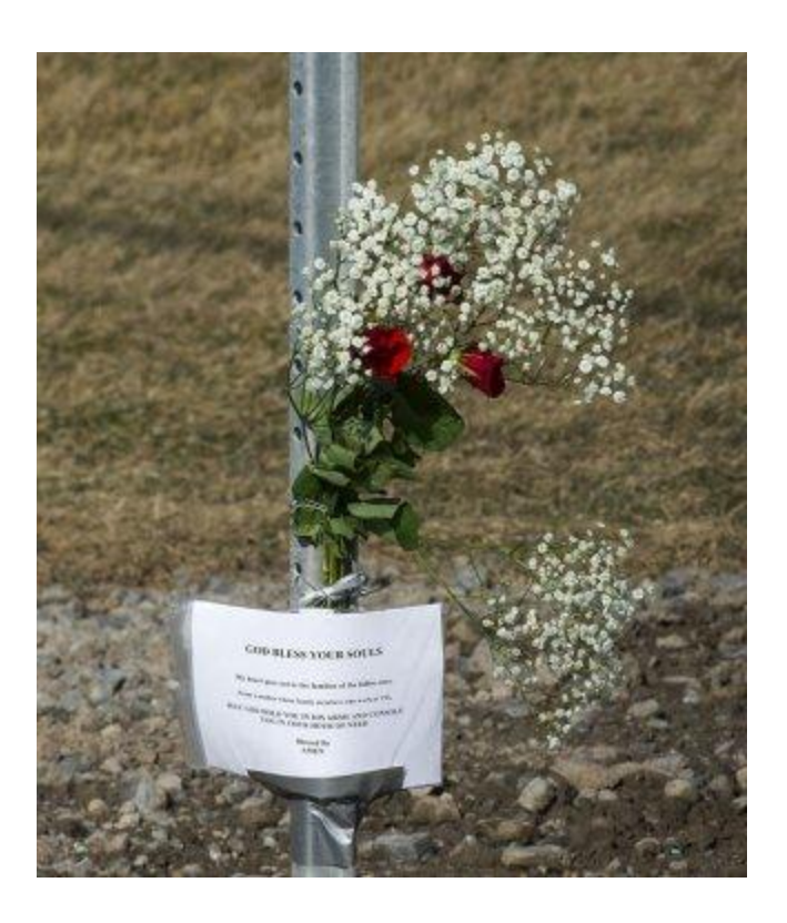
A bouquet and note commemorating the dead placed near the derailment site; February 27, 2012